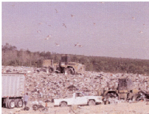
At left: The working face of the landfill.

The now patented liner system is less difficult and time consuming to construct, which reduces the cost of constructing the system. Two million dollars in contracting costs were eliminated because the simplified design allowed landfill employees to do most of the construction. A general contractor was considered unnecessary. Instead, the association employed individual sub-contractors and purchased materials directly, further reducing costs.